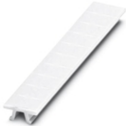
Zack marker strip, 10-section, horizontally labeled with the consecutive numbers: 11 ... 20, white, width: 6 mm

Please be informed that the data shown in this PDF Document is generated from our Online Catalog. Please find the complete data in the user's documentation. Our General Terms of Use for Downloads are valid ( http://phoenixcontact.com/download )